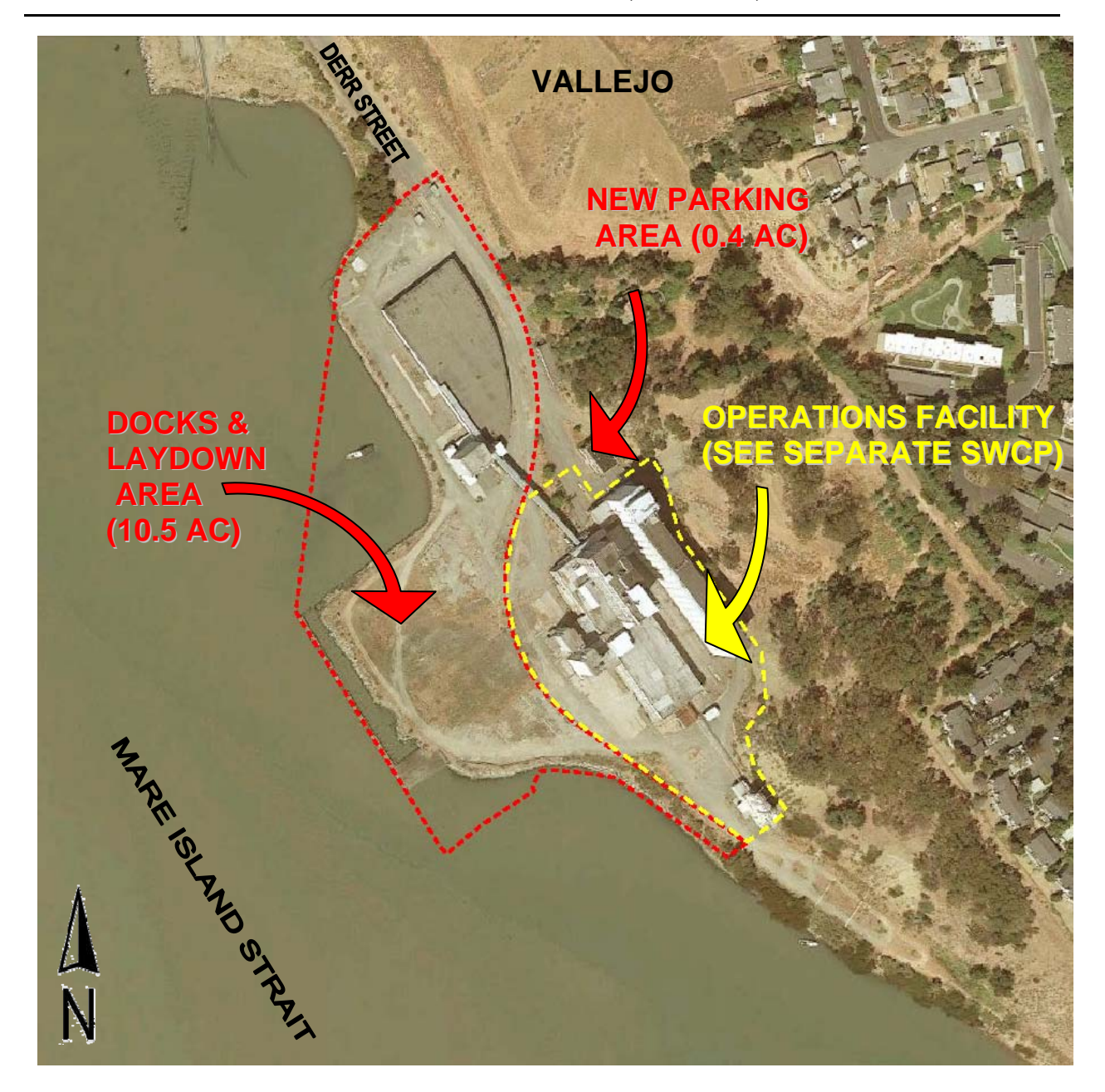
SITE MAP – VALLEJO MARINE TERMINAL, VALLEJO, CA