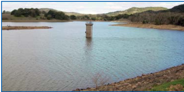
Lake Madigan Source Water for the Lakes Service Area

Drinking water, including bottled water, may reasonably be expected to contain at least small amounts of some contaminants. The presence of contaminants does not necessarily indicate that water poses a health risk. More information about contaminants and potential health effects can be obtained by calling the USEPA's Safe Drinking Water Hotline at 1-800-426-4791.