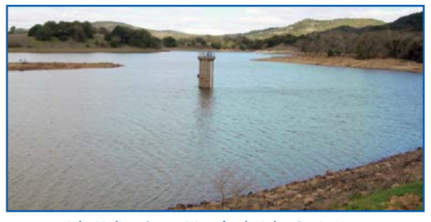
Lake Madigan Source Water for the Lakes Service Area

Drinking water, including bottled water, may reasonably be expected to contain at least small amounts of some contaminants. The presence of contaminants does not necessarily indicate that water poses a health risk. More information about contaminants and potential health effects can be obtained by calling the USEPA's Safe Drinking Water Hotline at 1-800-426-4791.